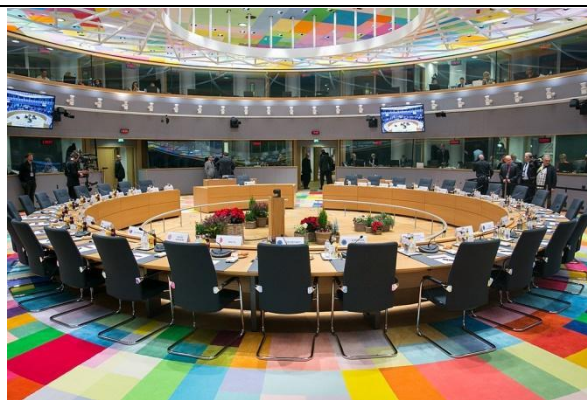
Europa building, Brussels, Belgium

Comment: The Council of the EU also called the Council is a European Institution. It's one of the two legislative bodies and together with the European Parliament serves to amend and approve or veto the proposals of the European Commission. This institution is purely intergovernmental composed of the 27 national ministers of the Member States. Depending on the topics discussed the Ministers will change. For example if this is a proposal about fishing quotas that needs to be discussed, it will be the 27 national Ministers of Agriculture that will negotiate the proposals.